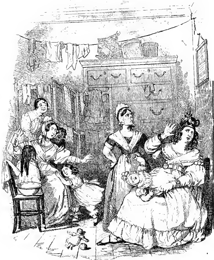
M rs Mayor's horror at the sight of the vizzy